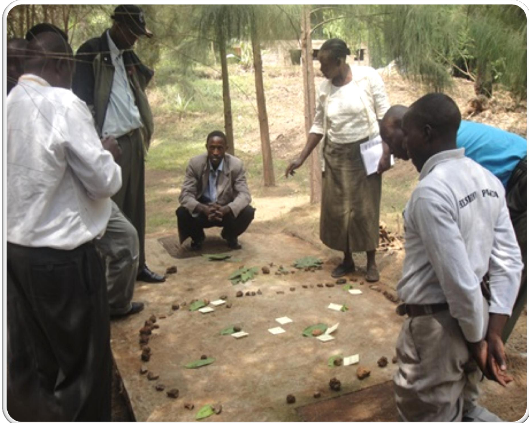
Figure 2: A group of owners using one of the PRA tools facilitated by KENDAT – "mapping" to identify the availability/non-availability of animal resources and services in their village