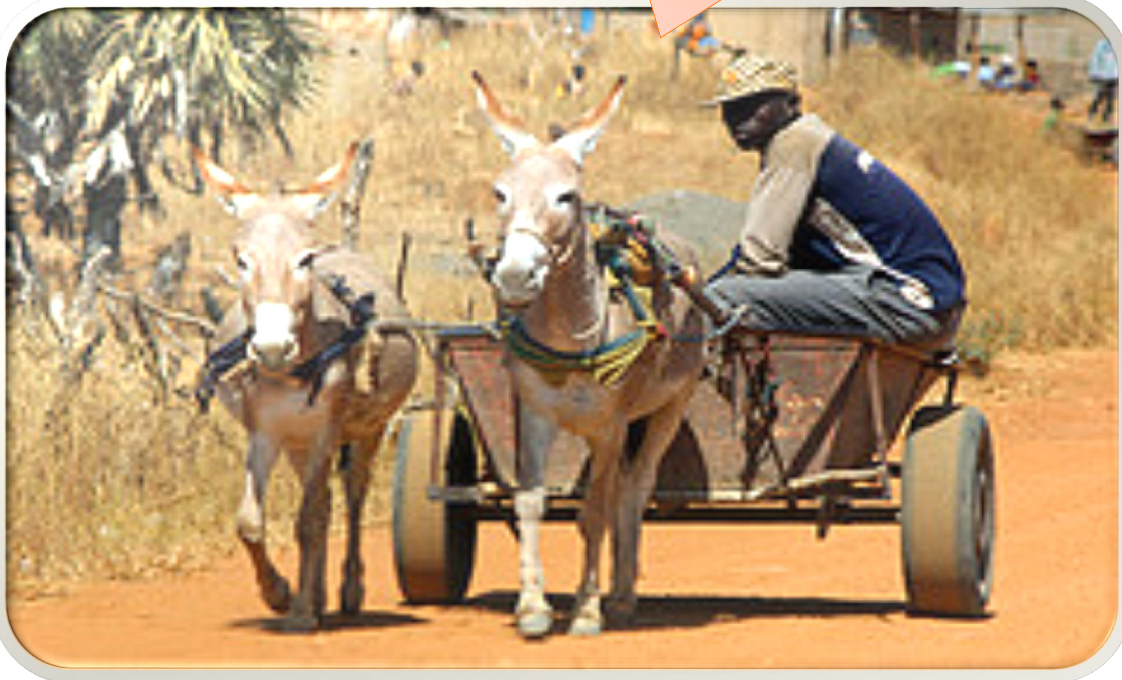
Figure 1: A typical donkey owner in Kenya using his donkeys to earn a daily wage