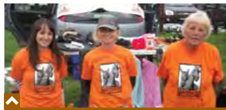
The Cambridgeshire group at one of their fundraising car boot stalls.

The group would also welcome donations of good quality clean tack for their sales, suggestions about places in the local area for holding events or talks, or interest from people who would like to be added to their forthcoming events mailing list.