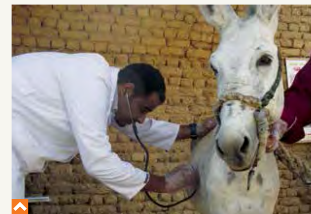
▲ A donkey gets checked over by the Brooke vet at the mobile clinic in Northern Hagaza.

£87.46 could run a mobile clinic for a day, including salaries, veterinary equipment and life-saving medicines.