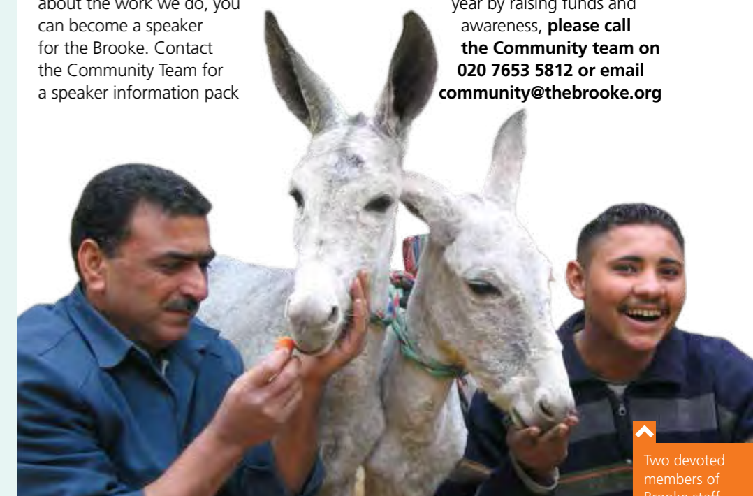
Two devoted members of Brooke staff and two donkeys at a clinic in Egypt

For more information on how to help the Brooke celebrate in our 80th year by raising funds and awareness, please call the Community team on 020 7653 5812 or email community@thebrooke.org