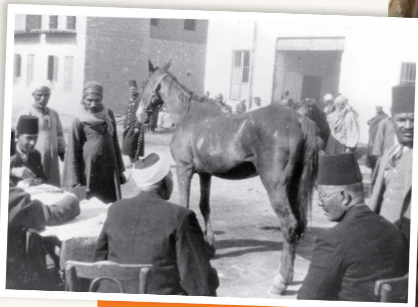
▲ The buying committee assessing an old war horse in Cairo

This year we would like to celebrate our story with you. Because, without you, none of our work would be possible.